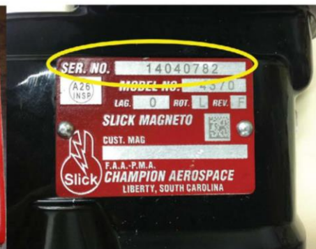
Figure 2. Magneto ID Label Date Code

* Changes from SB1-15 initial release in red