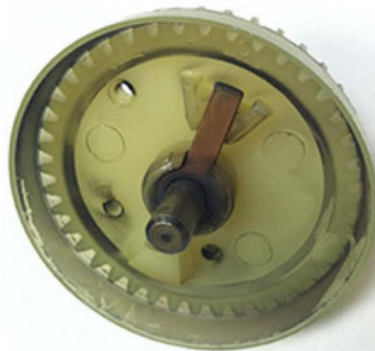
Figure 3. Affected K3008 Distributor Gear With Copper Electrode

REMOVE affected distributor gear assembly in subject magnetos and REPLACE with replacement distributor gear assembly, K3008, as soon as possible, not to exceed the next 50 hours. Document Service Bulletin compliance as written entry in applicable Aircraft and/or Engine logbook.