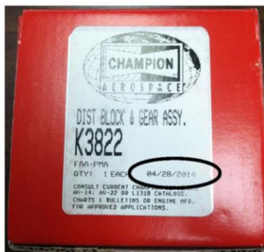
Figure 1. Replacement Kit Box Label Date Code

If it is not possible to confirm the version of the distributor gear that is installed in a given magneto from maintenance records, the magneto may be removed from the engine in order to have the housing and distributor block removed to allow visual inspection of the distributor gear. Distributor gears with Copper electrodes must be replaced with distributor gears with Monel electrodes.