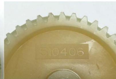
Figure 4. K3008 Distributor Gear Marked 510406 (Backside)

* Changes from SB1-15 initial release in red